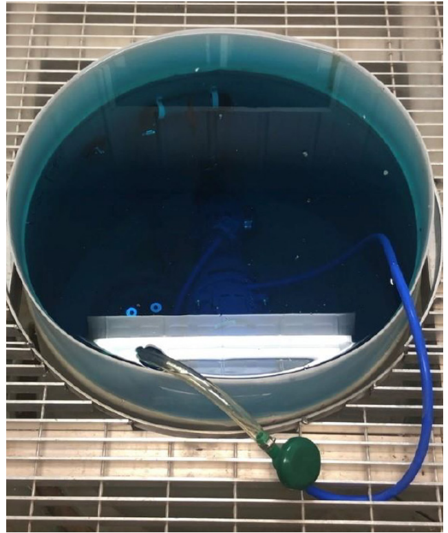
The valve pit was filled with water to a depth that was 300mm (11.8") over the controller