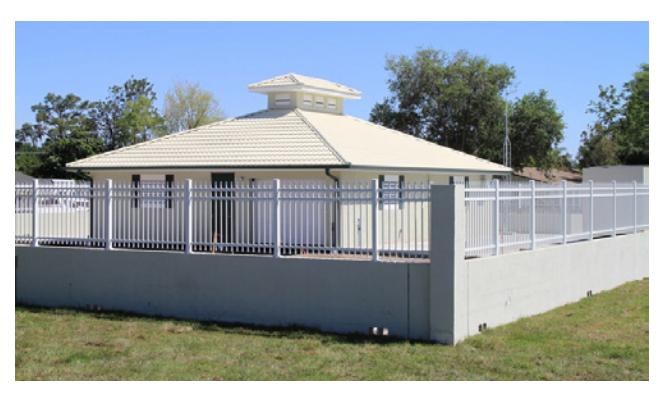
Vacuum stations cover a relatively small footprint, are odor free and can be designed to blend into the neighborhood.

"We have to protect our resources," Cole said. "If we lose our water quality, we're done. I can say that the water around Englewood is much better these days. I think Sarasota County and Englewood both did the right thing by installing vacuum sewers. Whenever you do something new, people will be tentative and a little concerned. I'm pleased that in hindsight, vacuum sewers were the right decision for Englewood and Sarasota County, and I think it's the right decision for Charlotte County now.