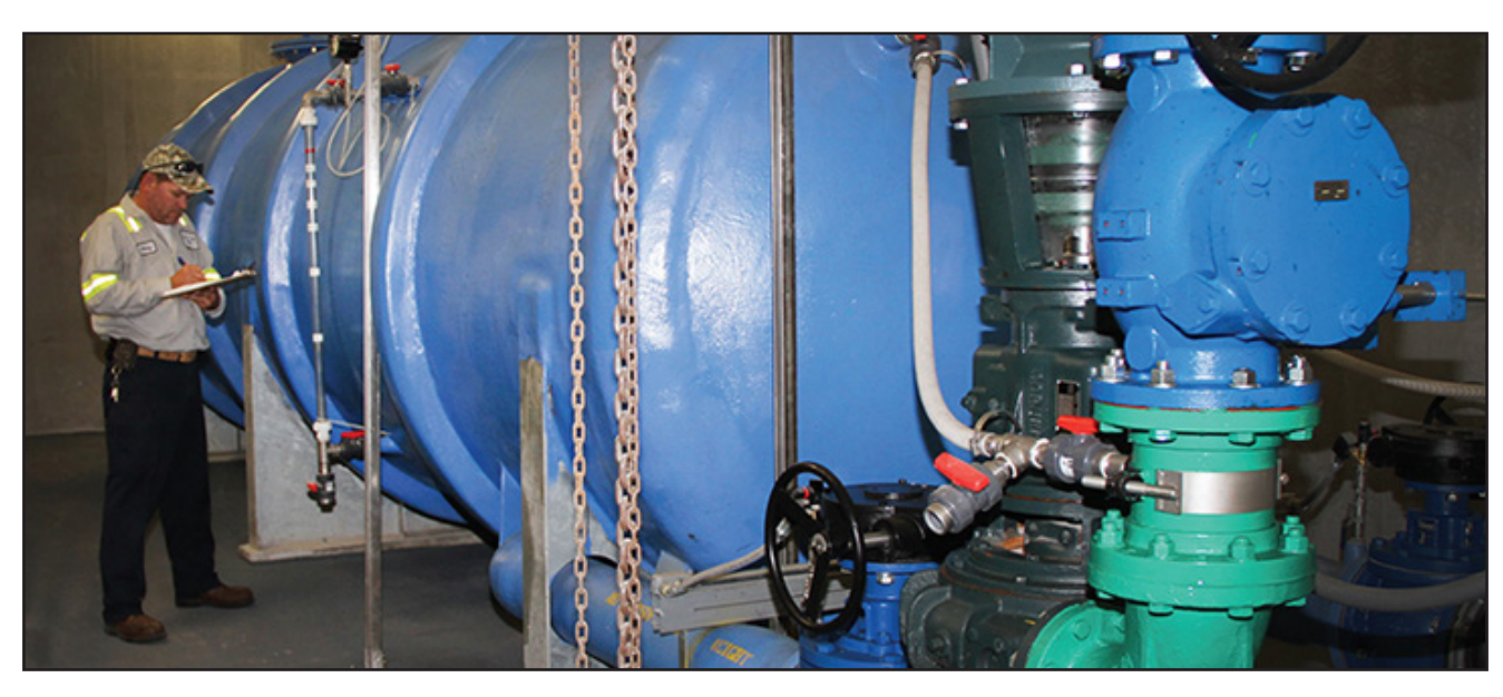
Vacuum stations are a safer, cleaner environment for public works employees.

That work is helpful for the communities of southwest Florida, where the experience of Giffels-Webster is reassuring to both community leaders and taxpayers. It is a long-term effort; construction on the new sewers in Charlotte County began in 2009 and it will likely take several more years before the project is completed.