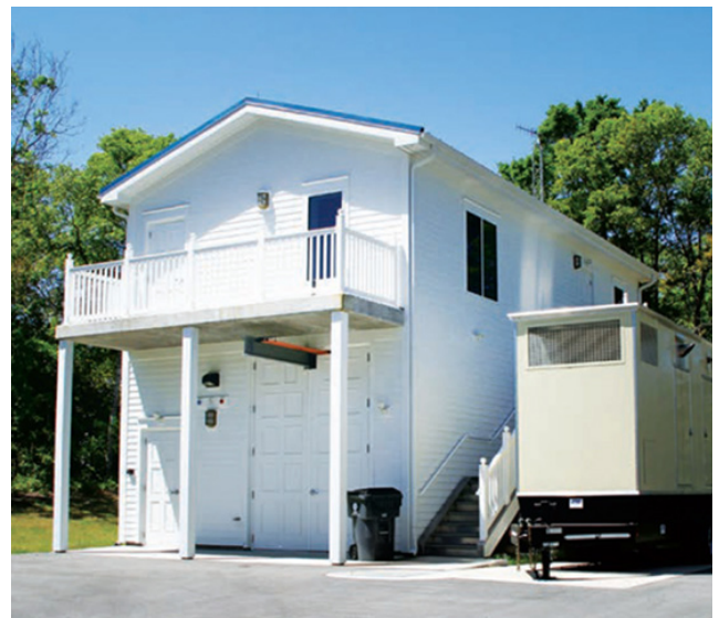
VACUUM STATION – This is one of Oak Island’s nine vacuum sewer stations. In the event of a power outage, the stations can be powered by a portable generator.

Losing electric power is not a big concern for Oak Island. The power lines are buried so they are not exposed to the extreme winds caused by hurricanes. Plus, there is backup generators ready should the electric grid be shut down for any reason. Oak Island was one of the only towns in the area to maintain power during most recent hurricanes. Airvac doesn’t just have the advantage of being a reliable system when electricity goes out, but also has the advantage of being more environment driven than traditional sewer systems. Part of Oak Island’s preparedness lies in the fact that they have vacuum sewers that prevent the threat of infiltration and exfiltration. Unless a component is damaged, such as a cleanout cap or valve pit, there is no threat of sewage contaminating the environment or storm water overwhelming the system and treatment plant. The benefits of sewer preparedness are significant; protection of the environment from sewage, the ability to have full sewer service quickly after a storm, and the safety of staff are all priorities.