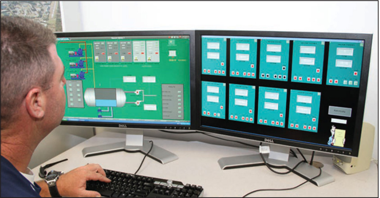
CONTROL CENTER – One person can control most aspects of Oak Island’s vacuum sewer system from a central command center. Here, the operator can see the status of each of the city’s nine vacuum stations and make adjustments to any one of them.