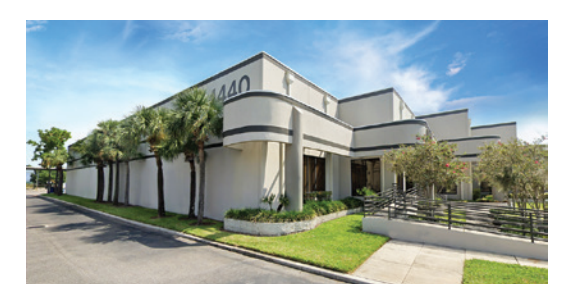
Airvac Customer Solutions Center.

Airvac operates its administration, engineering, fabrication, production, and service training facilities on a spacious 40acre site in Rochester, Indiana, encompassing over 100,000 square feet (9,300m<sup>2</sup>) of covered space. Our 8,500 square foot (790m<sup>2</sup>) Customer Solutions Center is situated in Tampa, Florida. Additionally, Airvac has sales and service representatives located in Europe, Latin America, and Australia.