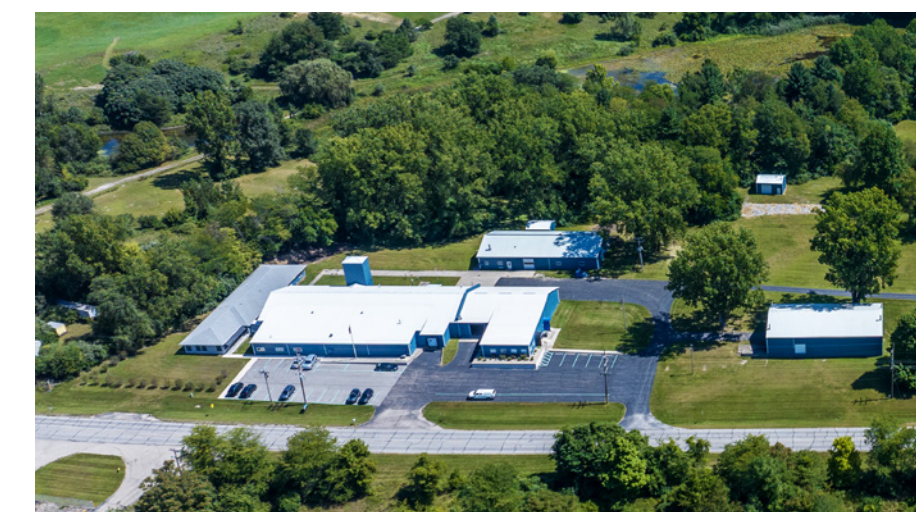
Airvac Administrative, Engineering, and Manufacturing Buildings.